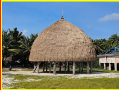
A traditional Nicobari hut