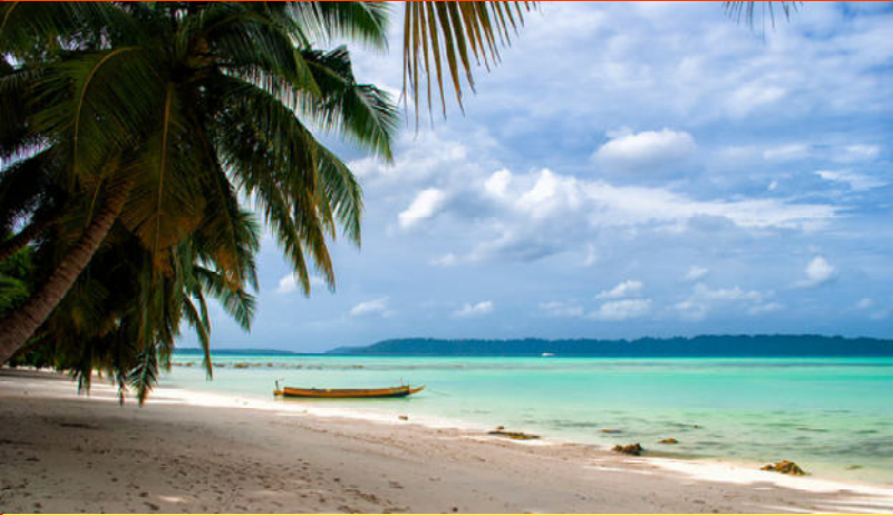
Swaraj Dweep in the Andaman Islands Shutterstock

A Geographical Indication (GI) tag is a sign used on products that have a specific geographical origin and possess qualities or a reputation that are essentially due to that origin. Essentially, it's a form of intellectual property that protects products with a unique link to a particular place. These tags acknowledge the unique origin and quality of these products, which are closely linked to the specific geographical area of the Andaman and Nicobar Islands.